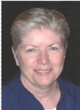
Library Friends President