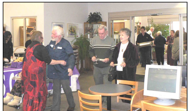
Guests Prepare to Eat, Drink, and Be Merry at the Taste of Rim Extravaganza