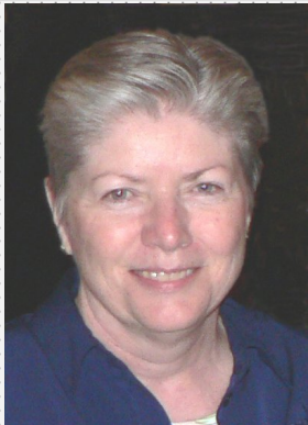
Library Friends President